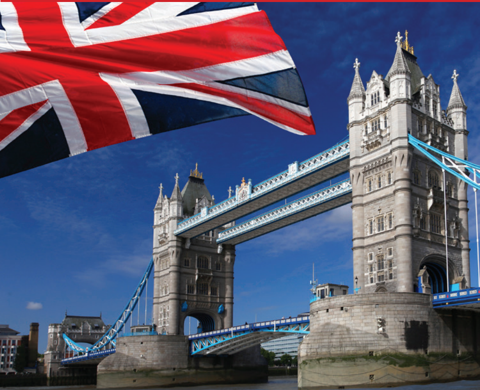
Tower Bridge, London